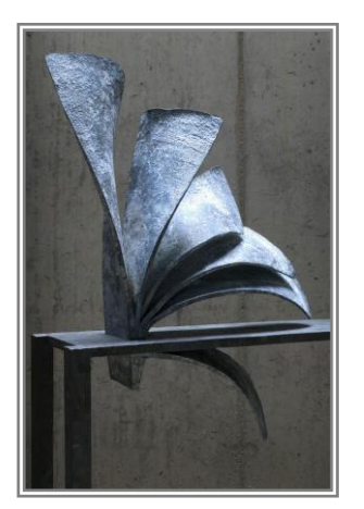
Xander Spronken Table Book, 2007 Wrought iron sculpture 141 x 98 x 27 cm. | 55½ x 38½ x 10½ in.