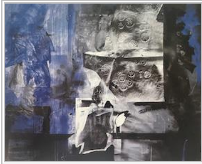
Antoni Clavé En noir et bleu Oil and collage on canvas 130 x 162 cm. / 51¼ x 63¾ in. 1989